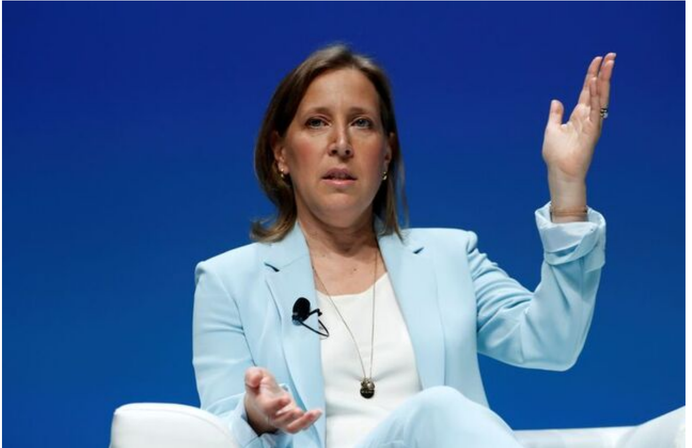
FILE PHOTO: YouTube CEO Susan Wojcicki gestures to show how big her ego is

One of her victims said: "... That bitch c*unt (and her fuck-buddies at Google) spent her time and money trying to kill me and other competitors. When she wasn't sucking off Larry Page, Eric Schmidt, Sergey Brin and David Drummond, she was destroying people's lives simply because she could and because she had paid off the White House. She and her cronies should spend the rest of their lives looking over their shoulders... "